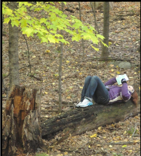
A fallen log provides a perfect spot for a student to record reflections in her nature journal.