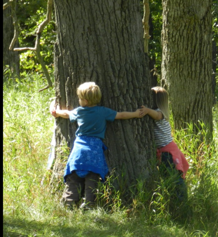
How many kindergarten hugs does it take to measure your biggest tree?